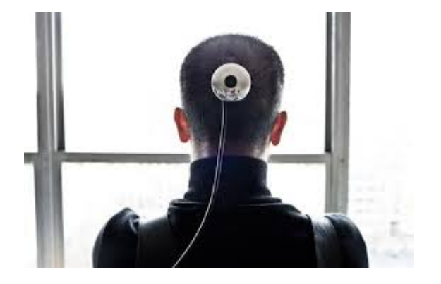
Fig. 3 Cyborg implanted in the central nervous system

By using this technology not only blind people can be assisted but it may also be possible to capture signals responsible for happiness, ,pain ,anesthesia etc .Experiments are also being conducted to establish wireless communication between two persons by placing similar chips, that are capable of using the energy in the body and can transmit and receive impulse signals between them. If this experiment is proved to be possible then "cyborg" which was assumed to be a science fiction is no more a distant dream. With this technique there would be no use of any speech to communicate Just the impulses in the human body can be used convey the information between each other. Thought communication will place telephones firmly in the history books. Another Important application of cyborgs would be in curing diseases. If this type of experiment works, we can foresee researchers learning to send antidepressant stimulation or even contraception or vaccines in a similar manner. With this we can gain a potential to alter the whole face of medicine, to abandon the concept of feeding people chemical treatments and cures and instead achieve the desired results electronically. Cyber drugs and cyber narcotics could very well cure cancer, relieve clinical depression.