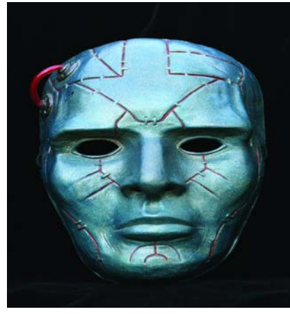
Fig. 6 Cyborg face mask

However, the fusion of humans and machines is not confined to fusion with engineering machinery. Think of machinery as technology in a wider sense. One of the largest modern technological fields is biotechnology. People are helped by biotechnology in the form of medical treatment, but we could be heading toward a scenario in which people are composed of biotechnology. If that is the case, the question must be asked: what are the people who have been integrated with technology in such a way? My background is in western philosophy, which since ancient times has continually asked the question, "What is humankind?" Traditional philosophy was founded on a distinction between human beings and machines (as well as animals), but nowadays technology is beginning to shake this distinction and cyborgs, which are the fusion of humans and machines, really have to be seen as a fundamental phenomenon in philosophical discussions. The question "What is humankind?" needs to be replaced by the question "What is a cyborg?"