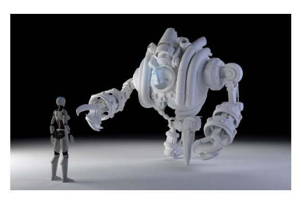
Fig. 5 Cyborg vs robot

Robots and cyborgs seem like the stuff of science fiction and to some degree they are. But what most people do not know is that cyborgs and robots do exist just not in the form that they depict in the movies. The main difference between a cyborg and a robot is the presence of life. A robot is basically a machine that is very advanced. It is often automated and requires very little interaction with humans. In comparison, cyborgs are a combination of a living organism and a machine. It doesn't necessarily have to be human; it can be a dog, a bird, or any other living thing.